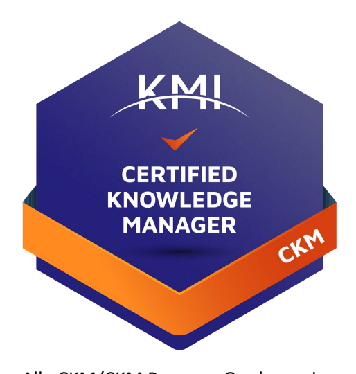
All eCKM/CKM Program Grads receive a Credly Digital Badge , signifying their accomplishment!